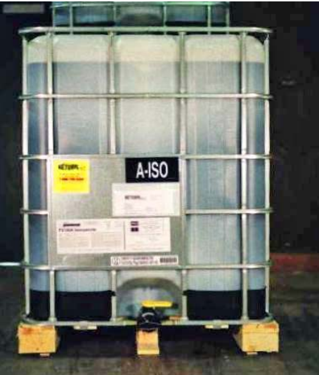
F2100 ISO NT Black Tote