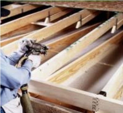
Two Component Urethane Adhesive