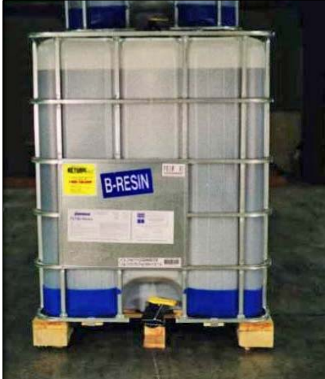
F2100 Resin NT Blue Tote